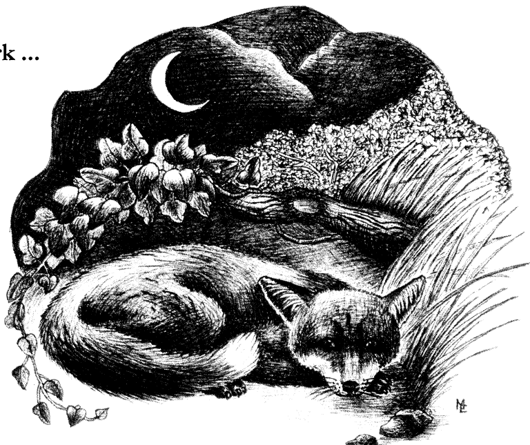
Fox - Canis vulpes